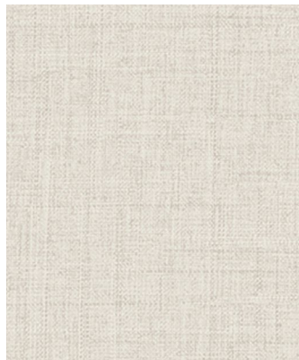
SERENITY WEAVE W7072