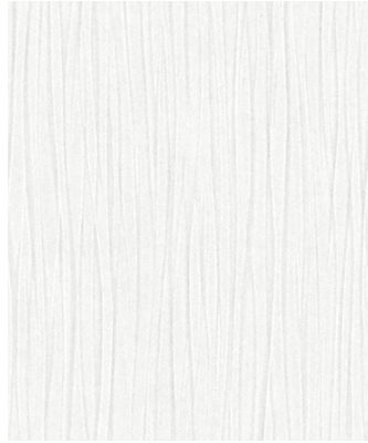
BIRCH BRANCHES W7049