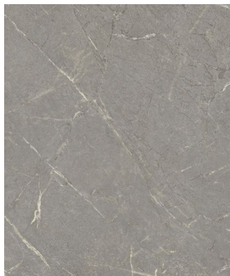
URBAN SOAPSTONE W7067