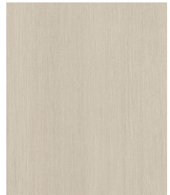
CHAMPAGNE WHISPER W7069