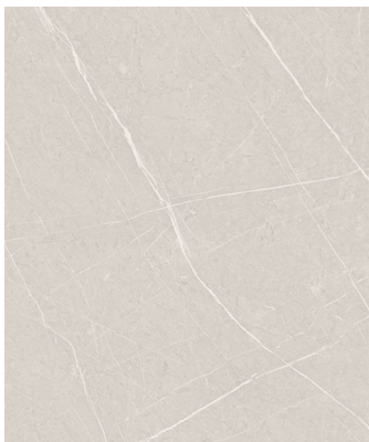
HARMONY MIST W7066