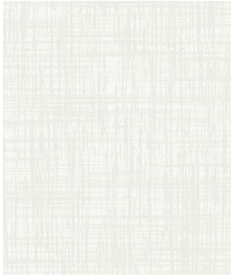
SILKEN WEAVE W7071

Choose from an array of 11 classic looks that will stand the test of time.