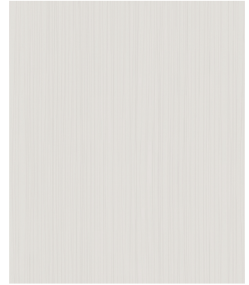
GRACEFUL LINES W7075