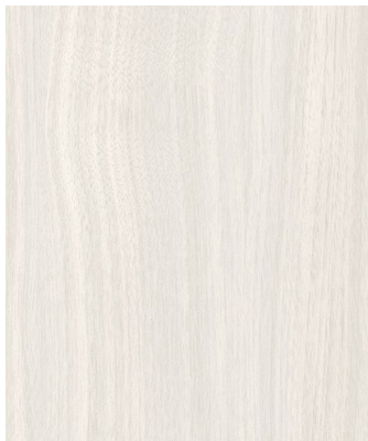
ASHEN WALNUT W7070